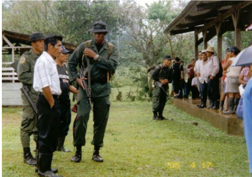
Panamanian armed policemen at a Naso General Assembly meeting.

exacerbated the armed conflict between the government forces and the Naso people, the majority of whom oppose the Bonyic Dam. 105